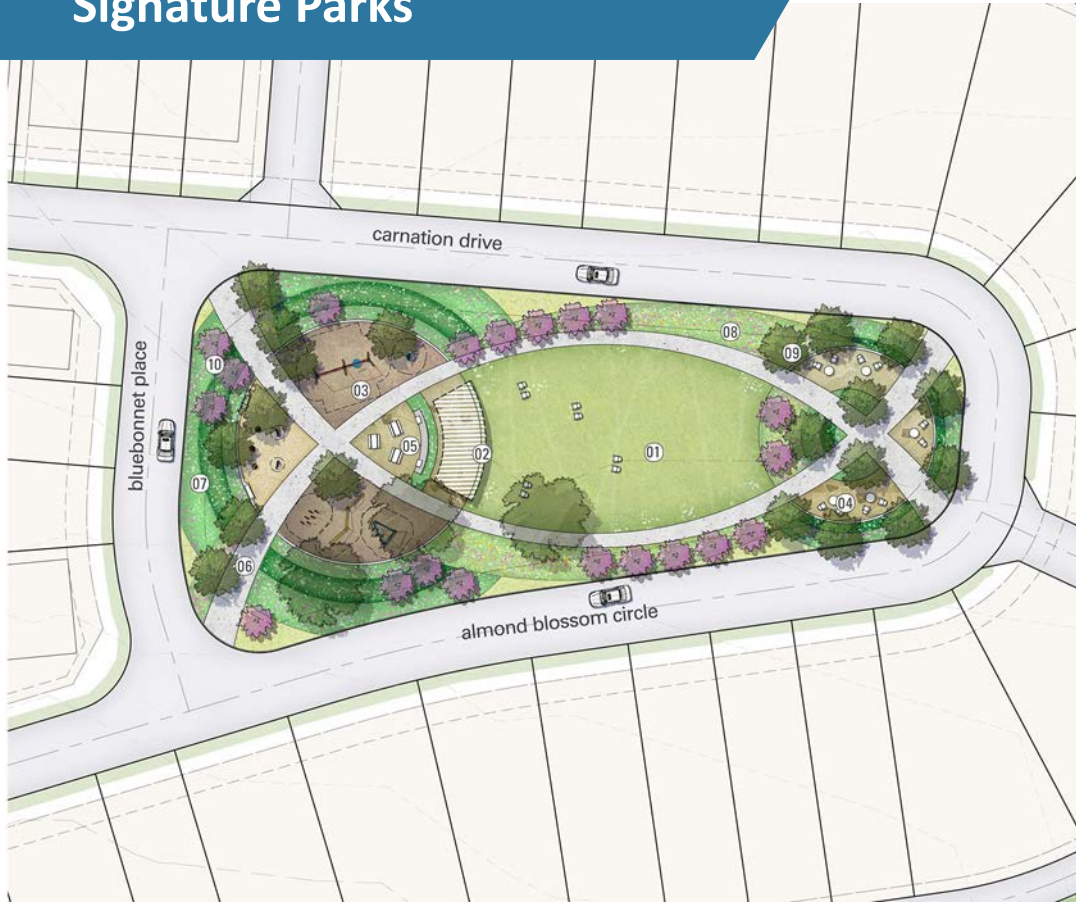
NORTHERN SIGNATURE PARK