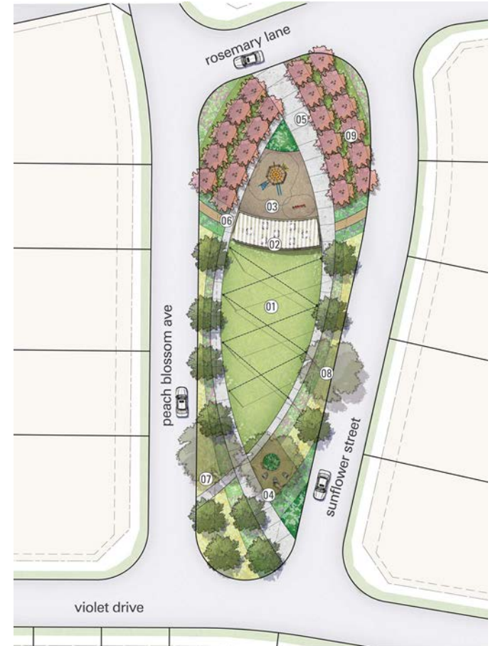
SOUTHERN SIGNATURE PARK