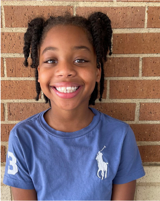
Denver Littles 2nd Grade Oakmont Elementary