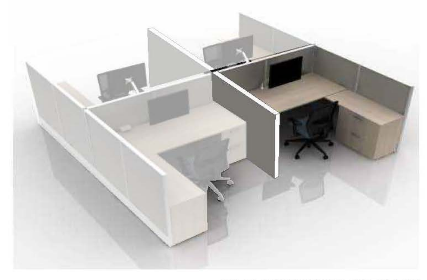
OPEN OFFICE WORKSTATION