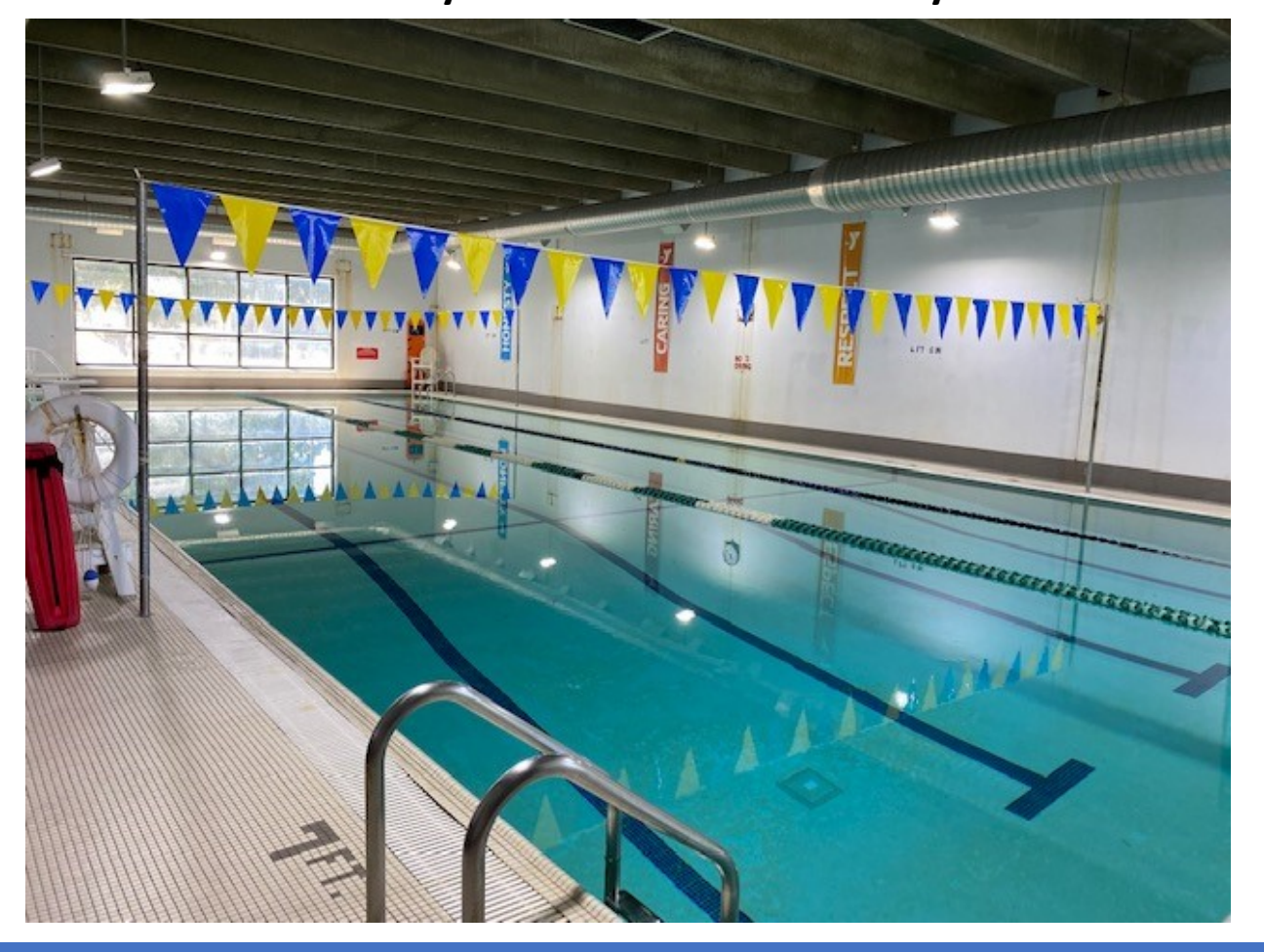
Future Ryan YMCA Practice/Competition Facility